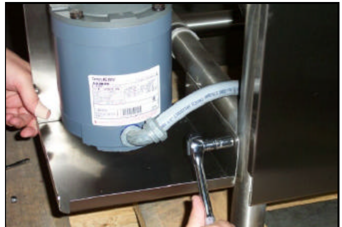
The Correct way to mount the drive motor.

17. The drive motor now needs to be reattached to the gear reducer. There are two methods for doing this. The first is to try and reinsert the drive motor shaft into the gear reducer with it (gear reducer) still attached to the unit. This is difficult but possible. Ensure that the key is in the keyway when you mate the parts. The second method and perhaps the easiest is to remove the gear reducer, mate the two parts and bolt them together and then put them on the unit at one time. This method takes a little more time. If you wish to remove the gear reducer and assemble the two components continue on to step 27.